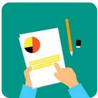
State of the Art

The main target users of the project products are Counselors/ Coaches and VET educators. Final beneficiaries are women - users of these services who face issues with their work life balance.